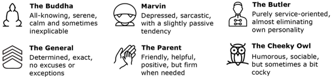
Figure 1. An incomplete list of possible personalities for the room intelligence.

Besides an adequate expression of the room intelligence’s personality, another central question is how the room intelligence can actively attract and guide its users’ attention in the environment.