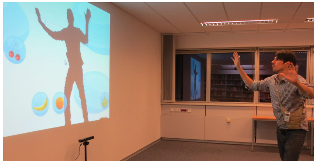
Figure 1: A user is interacting with the system perceiving EMS feedback.

Institute for Visualization and Interactive Systems University of Stuttgart {firstname.lastname}@vis.uni-stuttgart.de