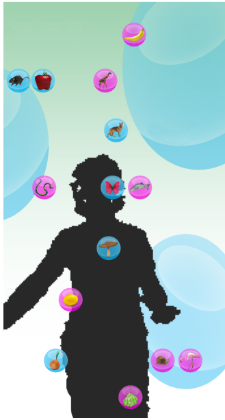
Figure 2: A user is interacting with the soap bubble game.