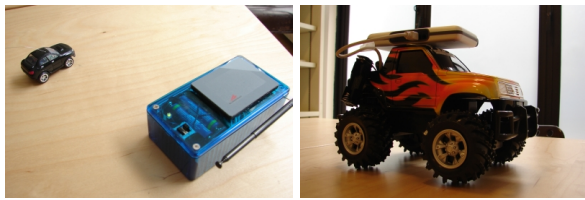
(a) Small Sketch-a-Move (b) Big Sketch-a-Move

a collaboration of designers and technologists to tackle this challenge.