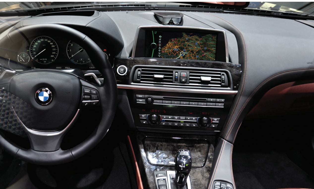
► Figure 1. Car controls, then and now. Left: 1938 BMW 328. Right: 2011 BMW 6 Series.

It is quite obvious that this number of controls could not be handled by a driver, who would be able neither to reach all of them nor to remember their locations. In particular, the introduction of GPS navigation systems and advanced infotainment features created the need for a display, which paved the way to combine all functions into one central multifunctional system. The benefits of haptic control and haptic feedback in the car seem to have been pushed aside by the need to provide more comfort and infotainment functions, not to mention additional safety systems. This trend has