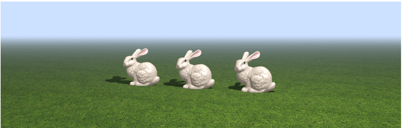
Figure 3: The Blinn-Phong reflection model with different shading frequency.

In the code skeleton, the scene creates three bunnies, a ground plane and a point light. Your task is to implement a scene similar to Figure 3, and an interactive demo can be found online 2 .