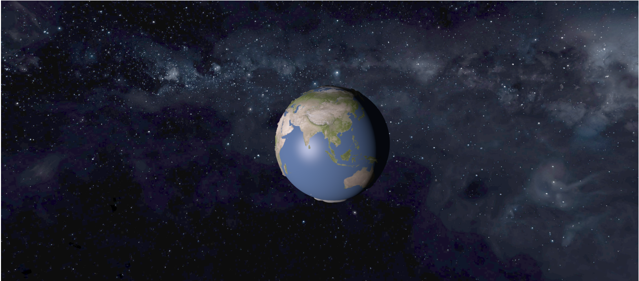
Figure 1: The Earth.