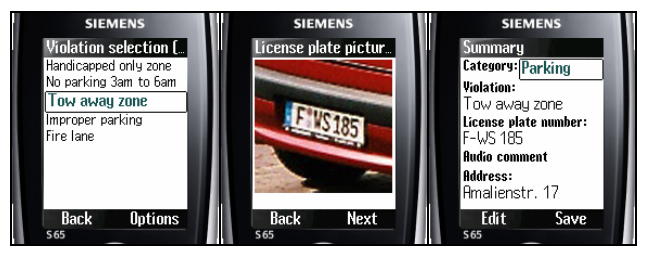
Figure 2. Screenshots of the Prototype

We build a prototype to explore the concept and to show that the implementation of such an information appliance is already possible with today's hardware and software platforms. As depicted in Figure 1 we used two different mobile phones (Siemens S65, Nokia 6600), the GPS device RoyalTek BlueGPS RBT-3000 and the mobile printer Brother MPRINT MV-140BT.