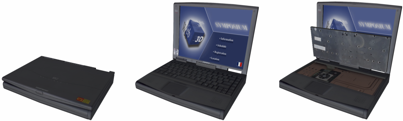
Figure 9. The three states of an interactive laptop