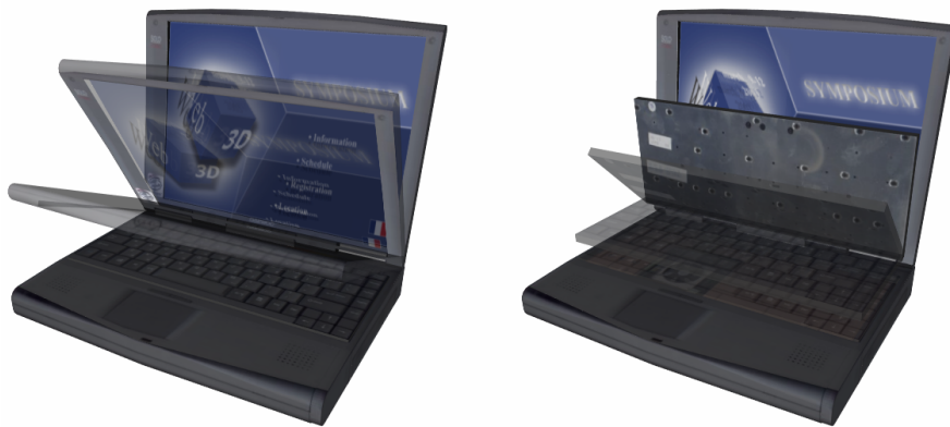
Figure 10. Two animations of the laptop example